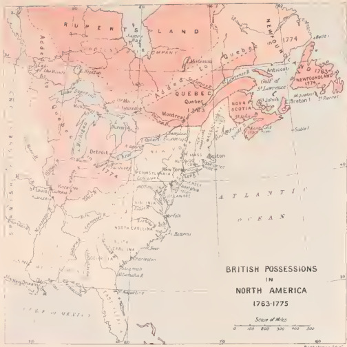
BRITISH POSSESSIONS IN NORTH AMERICA 1763-1775